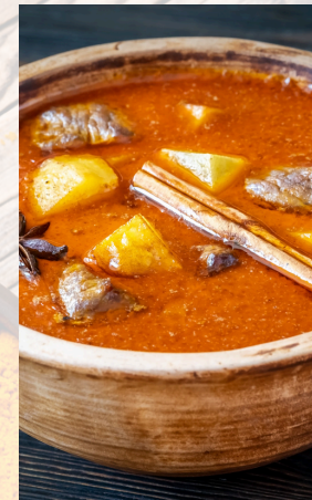
Massaman Curry Flavour