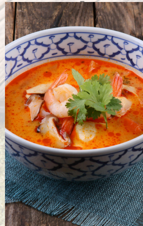
Thai Soup Spice

Raw heat at the end, garlic, coconut, very hot