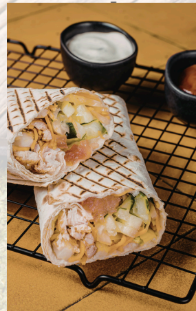
Lebanese Shawarma Spice

sweet mixed spice blend with coriander top note