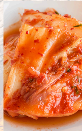
Kim Chi Spice