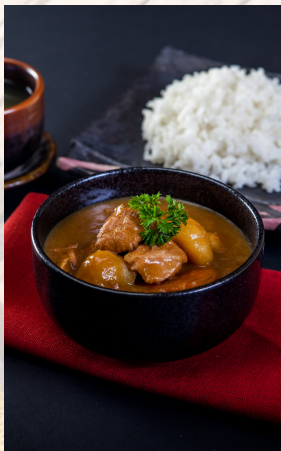
Japanese Curry Spice