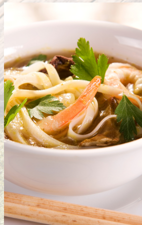
Thai Soup Spice