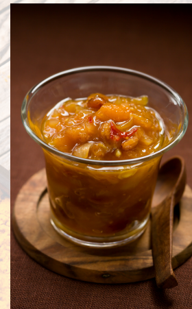
Fruit Chutney Spice

Traditional Anglo/Indian sweet, spicy, curry blend