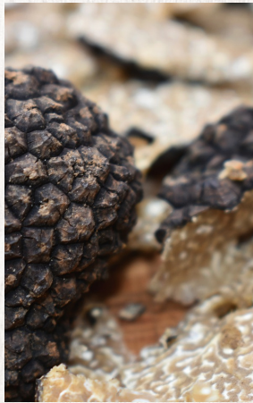
Black Truffle Flavour

Sweet, roasted upfront, caramelised garlic