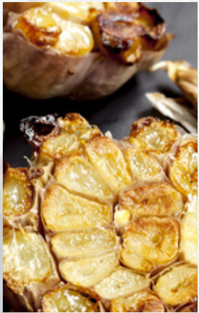
Roasted Garlic Oleoresin

Our latest 'Culinary Inspiration' range, created in the Hitchen Kitchen, includes caramelised sautéed onions and a rich black truffle, delicious on their own or combined to create layered flavour profiles. These Naturally Fabulous flavours and ingredients are ideal for a diverse range of seasoning applications including meat, plant-based, coatings, ready meals, sauces, condiments, dairy, soups and snacks.