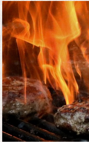
Grill Type Flavour