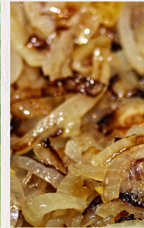
Sautéed Onion Flavour