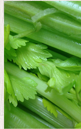
Celery Flavour (celery replacer)