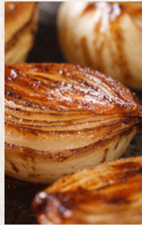
Roasted Onion Oleoresin